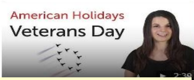
Learn American Holidays – Veterans Day Learn American Holidays - Veterans Day – YouTube