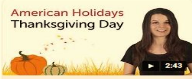
Learn American Holidays – Thanksgiving Day Learn American Holidays - Thanksgiving Day - YouTube